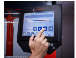
NEW 10.5" Touchscreen