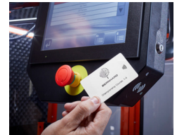
NEW RFID Technology