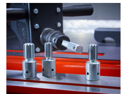
NEW Direct reel drive

The Express Dual 5500 is a truly connected reel sharpening solution featuring our unique laser reel surveying system, 10.5" touch screen, contactless RFID cards and direct reel drive.