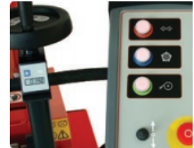
Simple control panel